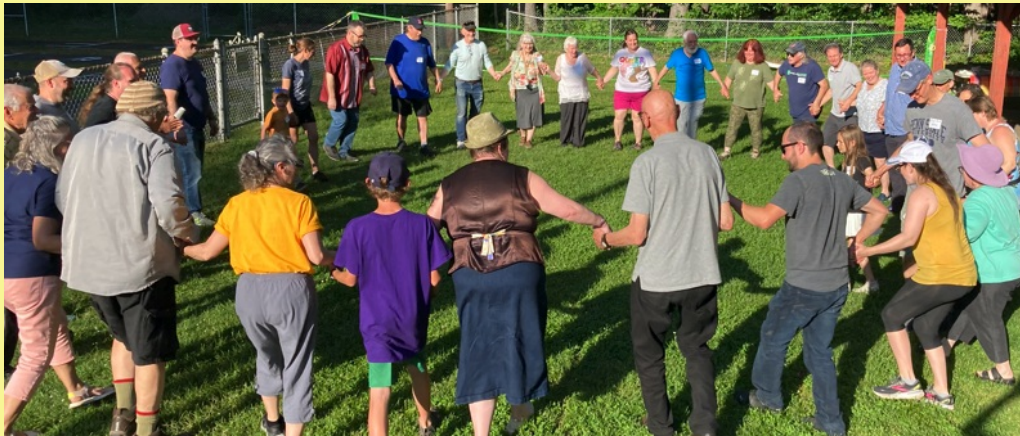
Faith Festival at Wheelock Park