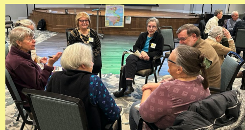
Book Discussion Groups with the Cohen Center