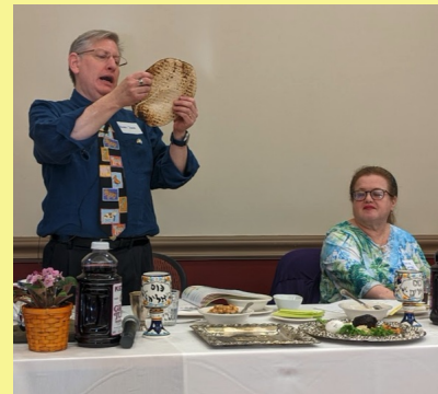
Interfaith Passover Seder